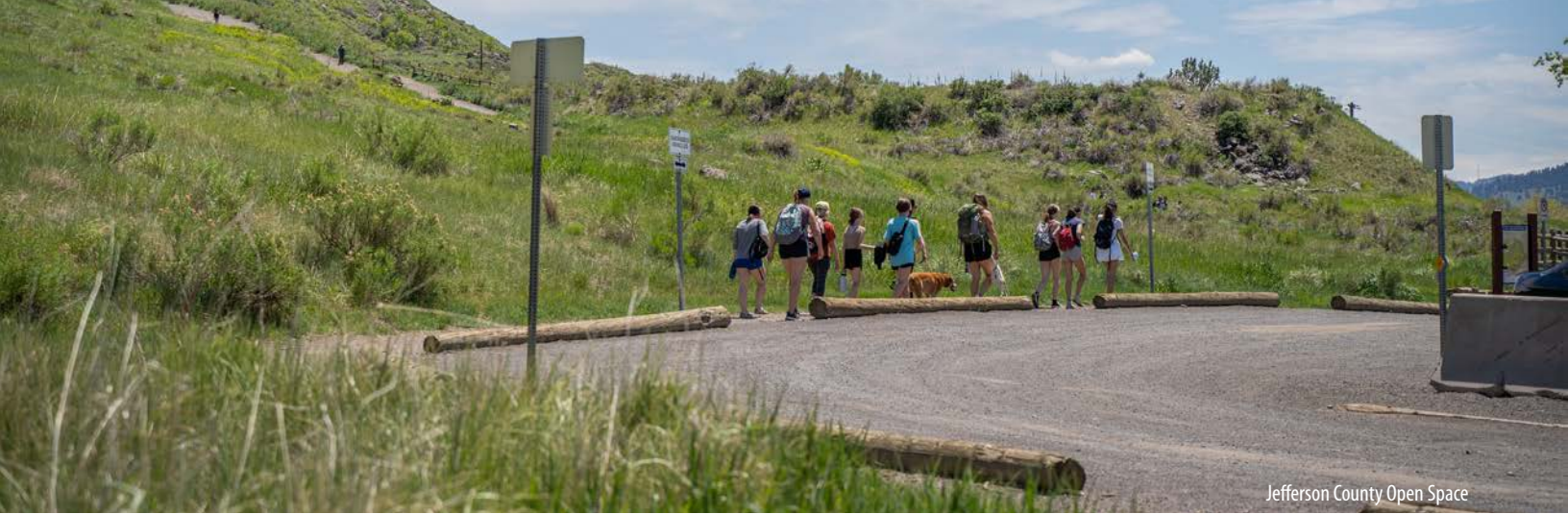
Jefferson County Open Space